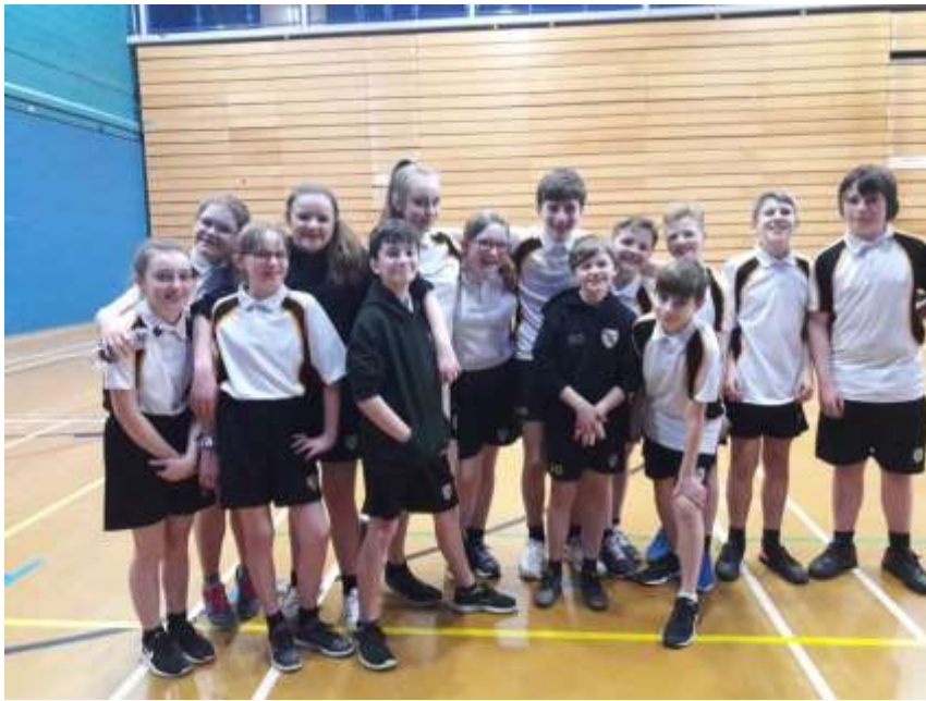
The Year 8 Partnership Games Team